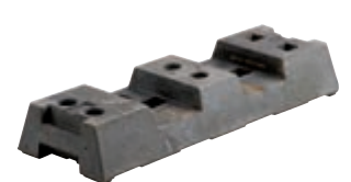
Carrying foot made of recycled material