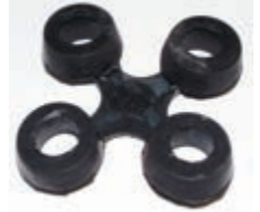
Connecting piece. Type: 3158