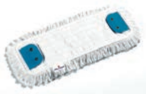
Mop Type: 6757