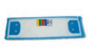
Mop Type: 4768