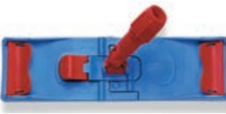
Holder Type: 6756