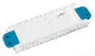
Mop Type: 4766

Recommended to the maximum temperature of 90 °C with the use of standard fabric detergents. Do not use with acid or chlorine.