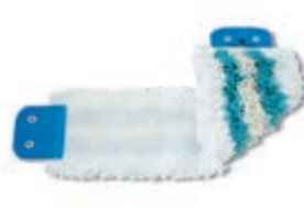
Mop Type: 4767