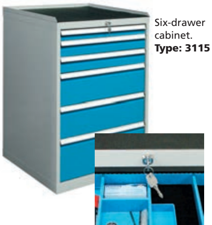
Six-drawer cabinet. Type: 3115