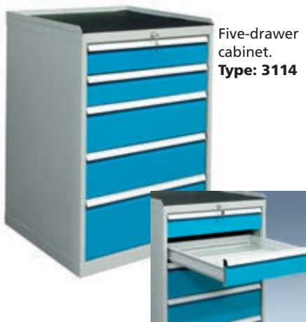
Five-drawer cabinet. Type: 3114