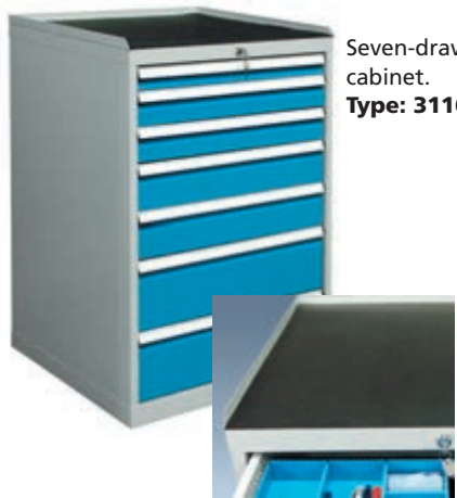
Seven-drawer cabinet. Type: 3116