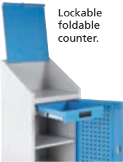
Lockable foldable counter.