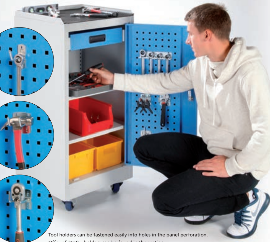
Tool holders can be fastened easily into holes in the panel perforation. Offer of 3559-x holders can be found in the section "WORKSHOP EQUIPMENT".