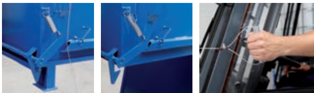
Easy and safe control from the driver's seat.