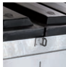
Adaptation for lid lock