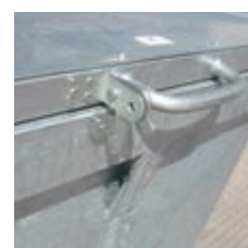
Lock detail – gravity system