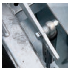
Arrest in open position with damper