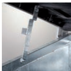
Lid arrest in open position