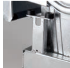
Mechanical stop of the lid