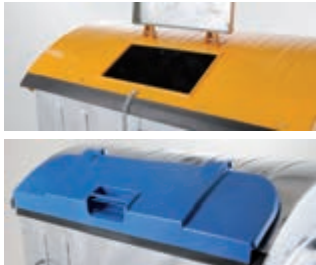
Design "lid in the lid" - alternatives metal / plastic