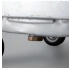
Oil-tight brass plug