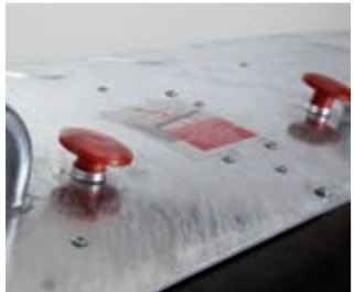
Children's safety lock - to EN 840-6