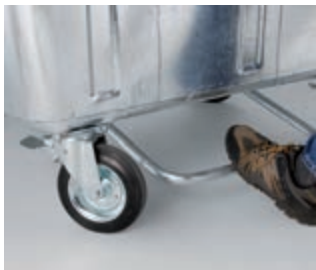
Lid foot opening