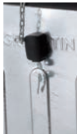
Lid chain lock / triangular