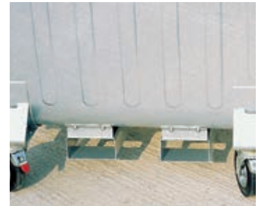
Modification for handling by fork-lift truck.