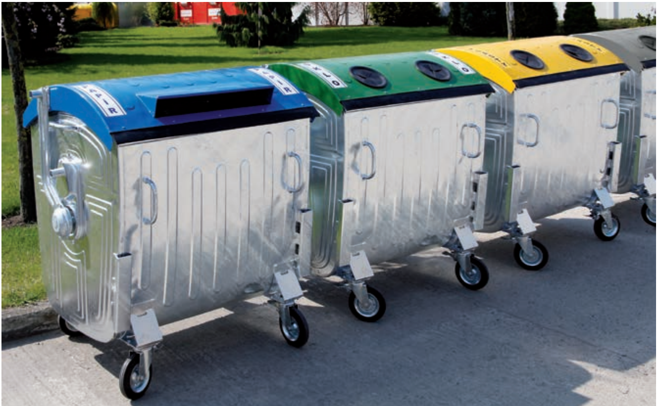
Paper Type: 1132E-1