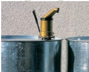
Hand pump fixed in the barrel.