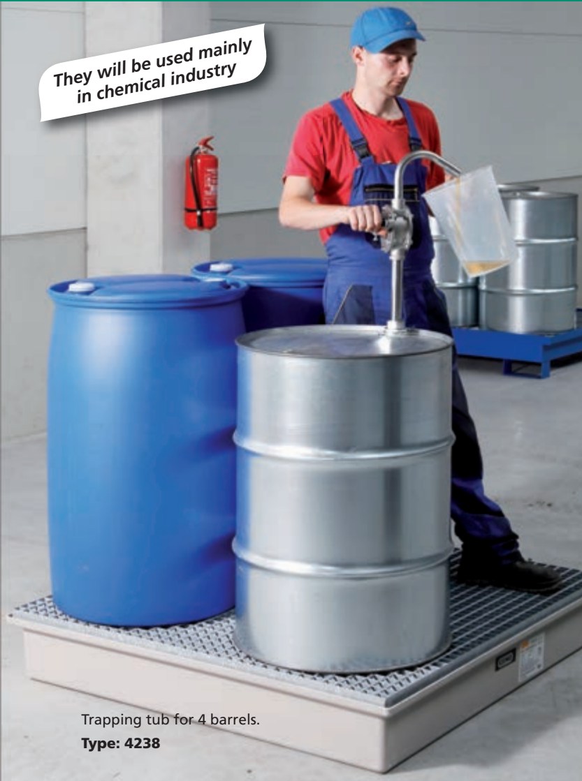
Trapping tub for 4 barrels. Type: 4238

They will be used mainly in chemical industry