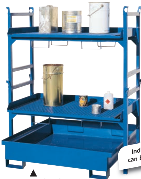
▲ Trapping tub. Type: 1262