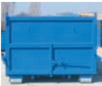
Flap, hinges on top + screws.

- The containers are made from closed profiles 100 x 60 mm, sheathed with plate of 3 mm thickness, container bottom of plate of 5 mm thickness. The containers may be equipped with back inclinable facing or double-wing doors with locking mechanism. Usable for transportation of loose material and solid state waste. Other dimensions and designs are available if required.