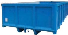
- Version Tatra lorry with a lower rack.