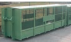
- Netted version with a saddle roof.