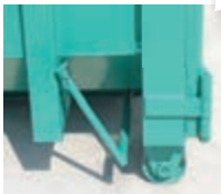
Second securing of double-wing doors.