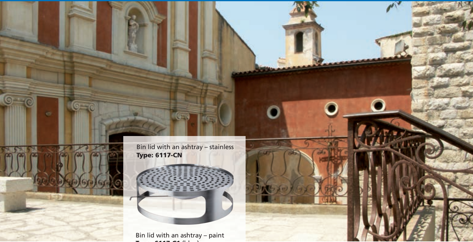
Bin lid with an ashtray – stainless Type: 6117-CN