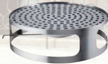
Bin lid with an ashtray – paint Type: 6117-C1 (blue) Type: 6117-C2 (green) Type: 6117-C5 (brown) Type: 6117-C8 (grey)