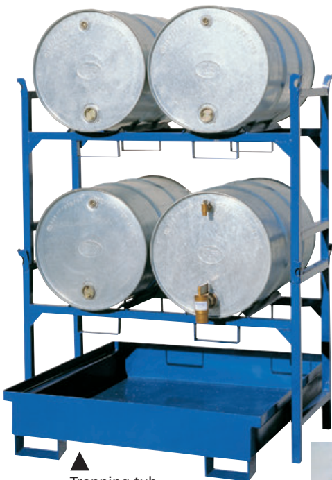
▲ Trapping tub. Type: 1262