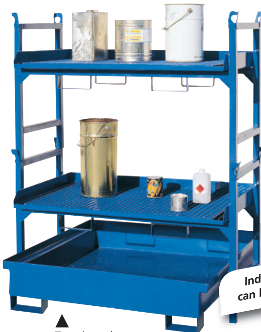
▲ Trapping tub. Type: 1262