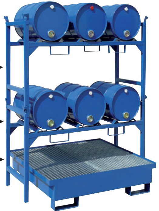
▶ Trapping tub. Type: 6077