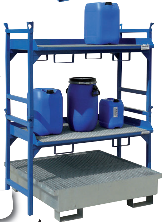
▲ Trapping tub. Type: 6077-Z

Individual components can be combined mutually