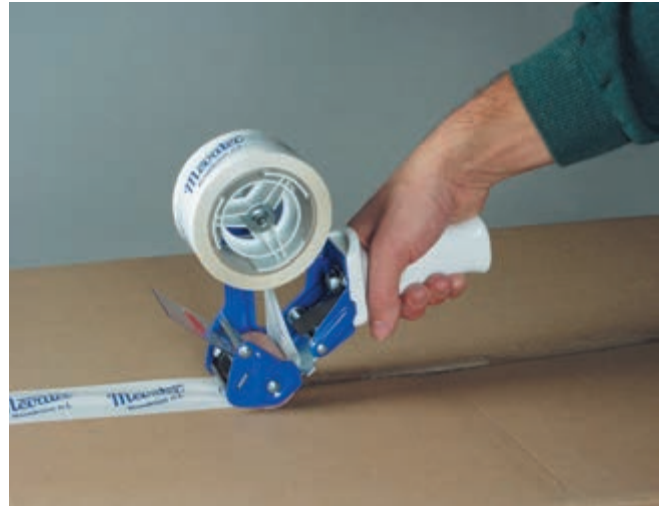
Type: 6517 Polypropylene adhesive tape, decoiler 50 mm.