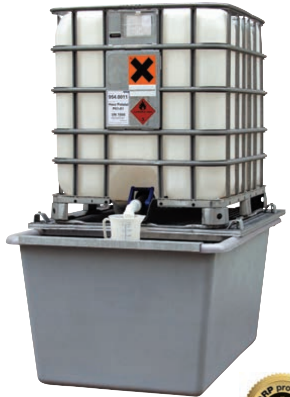
Trapping tub 1,000 l. Type: 4239