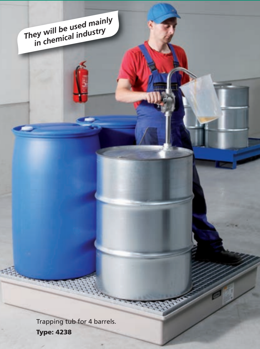
Trapping tub for 4 barrels. Type: 4238

They will be used mainly in chemical industry