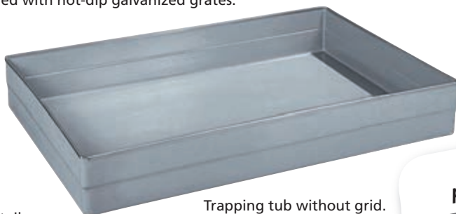
Trapping tub without grid. Type: 4498