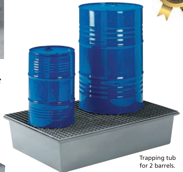
Trapping tub for 2 barrels. Type: 4237