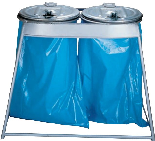
Type: 0039 – Frame allows placing of stickers or spraying of a sign