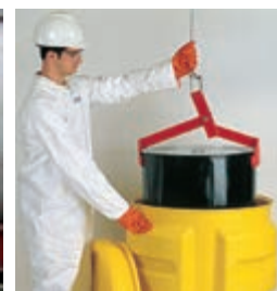
4 variants of use