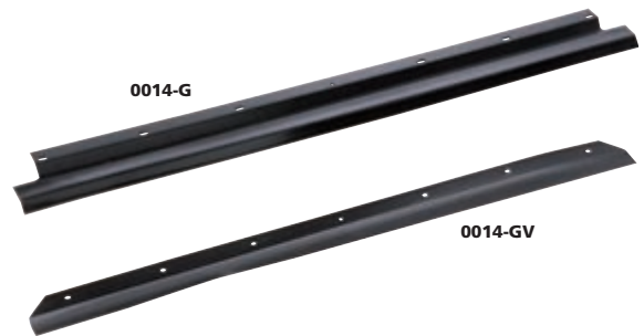
Type: 0014-G Strip for a round lid