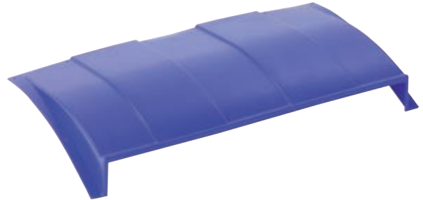
Type: 0054-S Paper insertion roof