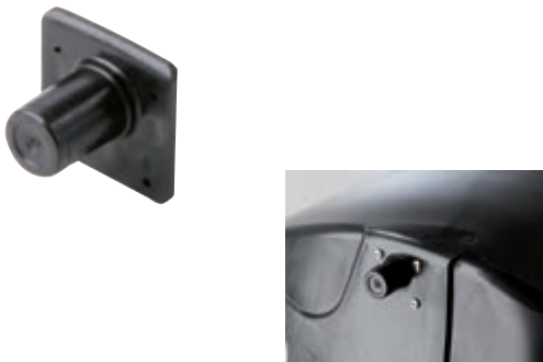
Type: 0014-C Lid pin