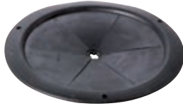
Type: 0056-G Round rubber insertion