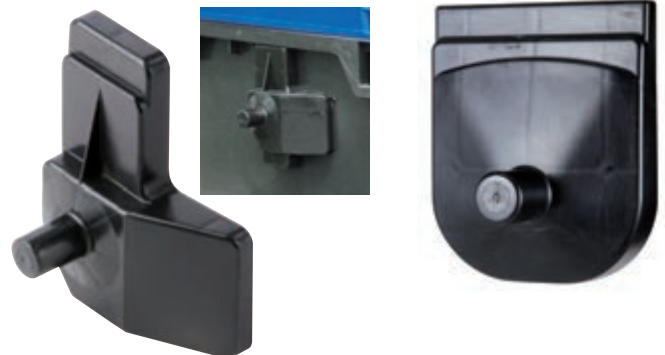
Type: 0014-CP 1,100 l container pin – right